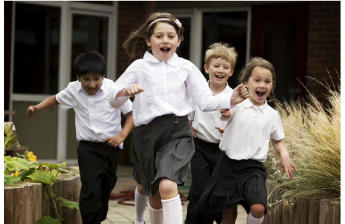
Published by the Mix96 News Team at 5:45am 19th October 2017.

Facebook Twitter Pinterest WhatsApp Email